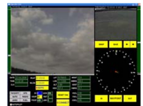
Illustration 2: Video and operating control display.